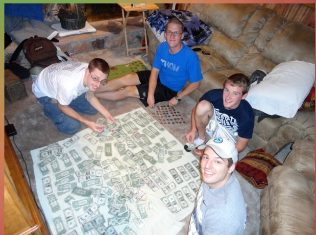
Contrary to popular belief, these canners are not playing poker with the day's earnings, rather they are attempting to dry the wet bills on a towel.