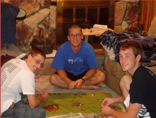
A group of actuarial science students count all the collected change after a long day of canning