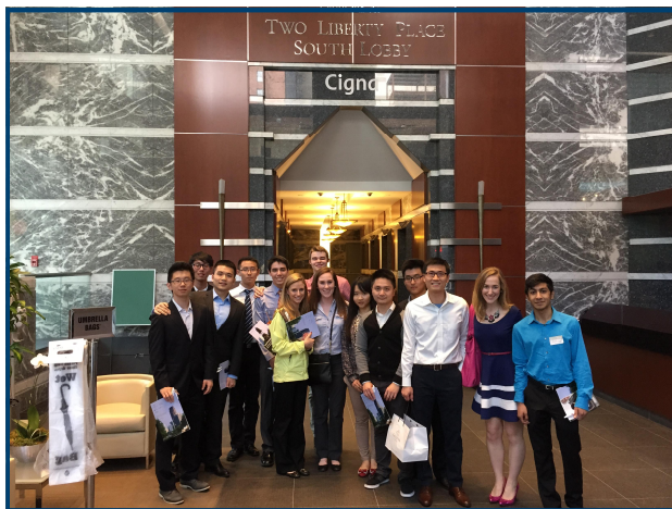
Club trip to Philadelphia this past semester!