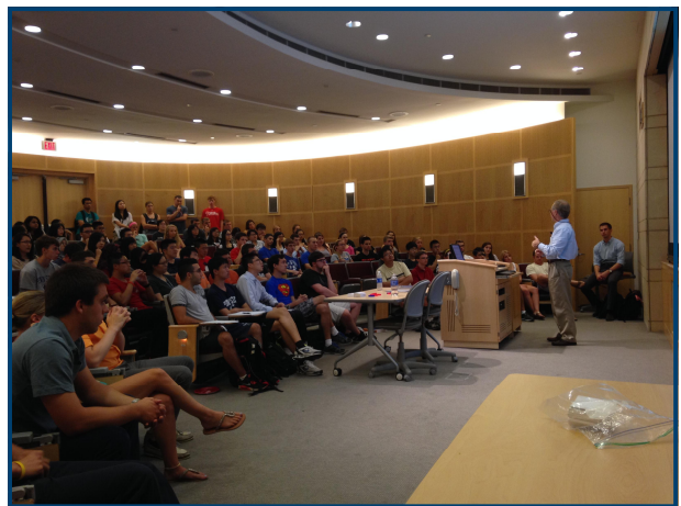
Club introduction and info meeting from the Fall