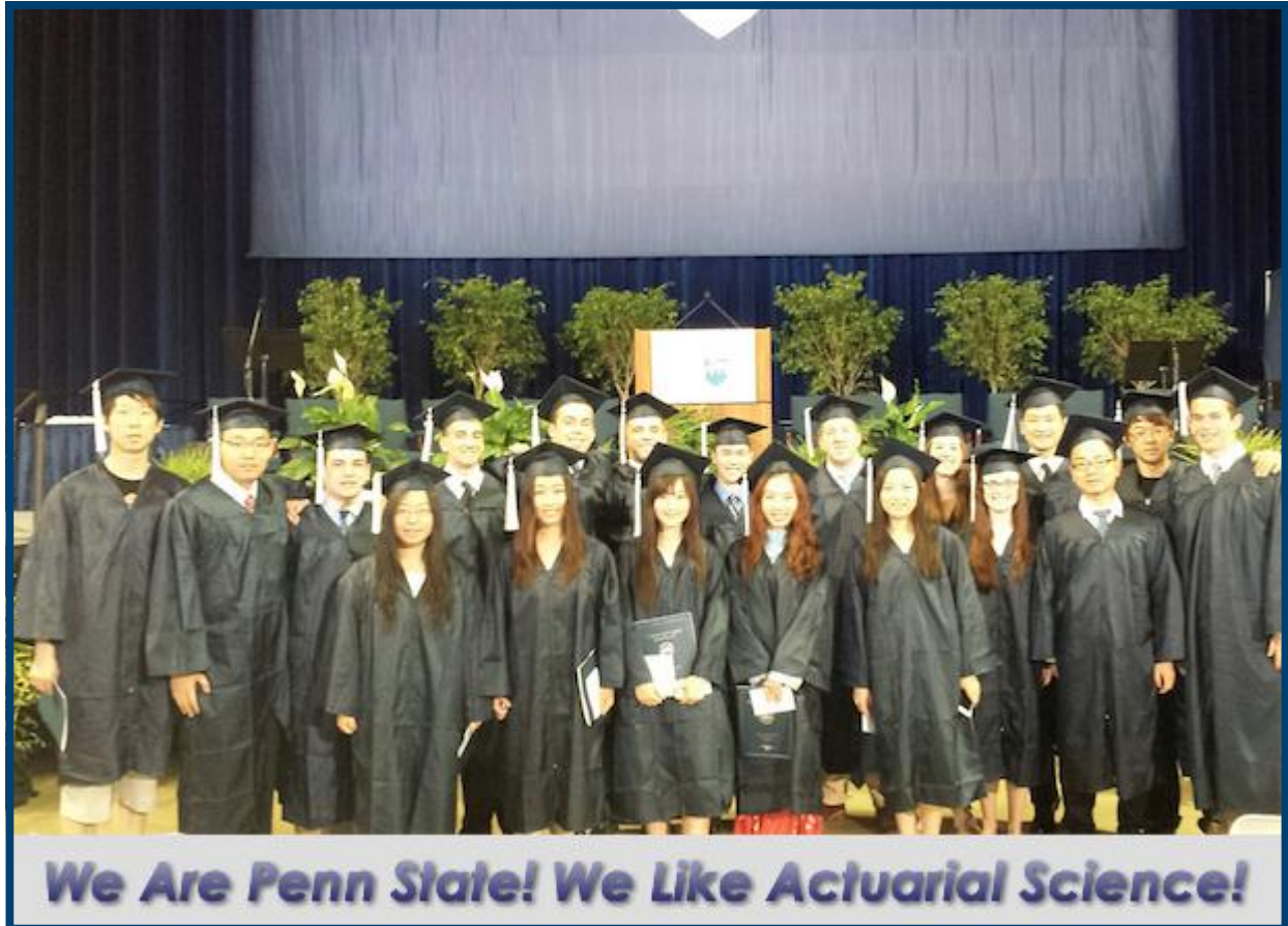
2015 Eberly Graduates