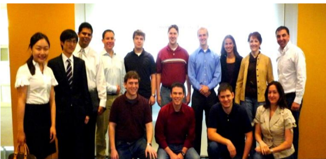
Act Sci students at Towers Watson

One group visited Towers Watson in the morning to learn about actuarial roles in retirement consulting. Two senior associates gave an overview on the company and the industry, followed by four senior consultants with more than 10 years of experience talking to us about their projects. These projects are worth more than $20 billion. We also shadowed with junior associates (entry level actuaries).