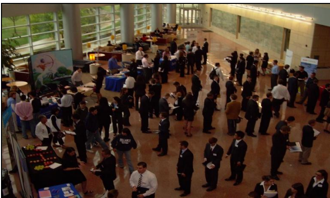
Students interact with recruiters at the Career Fair