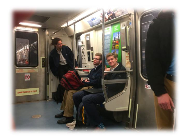
Subway to Act Sci Wonderland