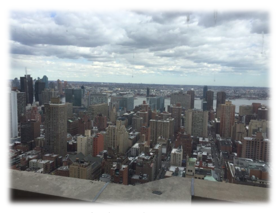
NYC in the eyes of Actuaries