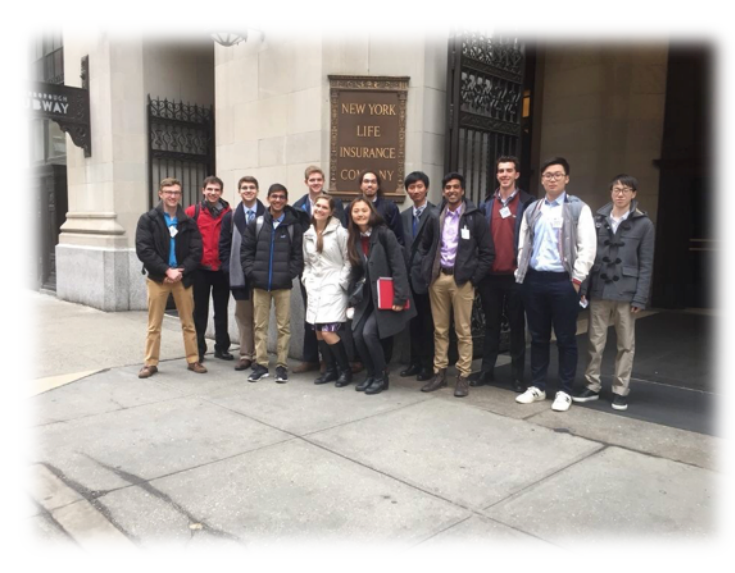
New York Life